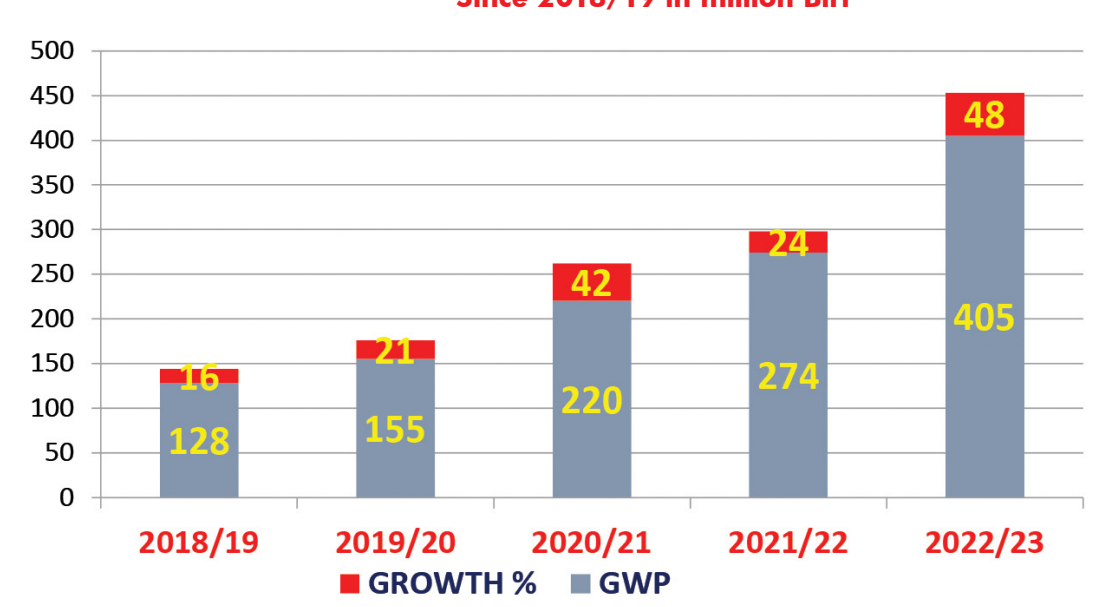
Figure-4: GWP and Annual Growth of the General Insurance Business, Since 2018/19 in million Birr

These combined efforts resulted in the substantial increase in the General Insurance Gross Written Premium, positioning ELiG ahead of the industry average. The company's ability to retain customers and its strategic approach to market penetration has proven effective in driving growth and solidifying its position in the insurance industry.