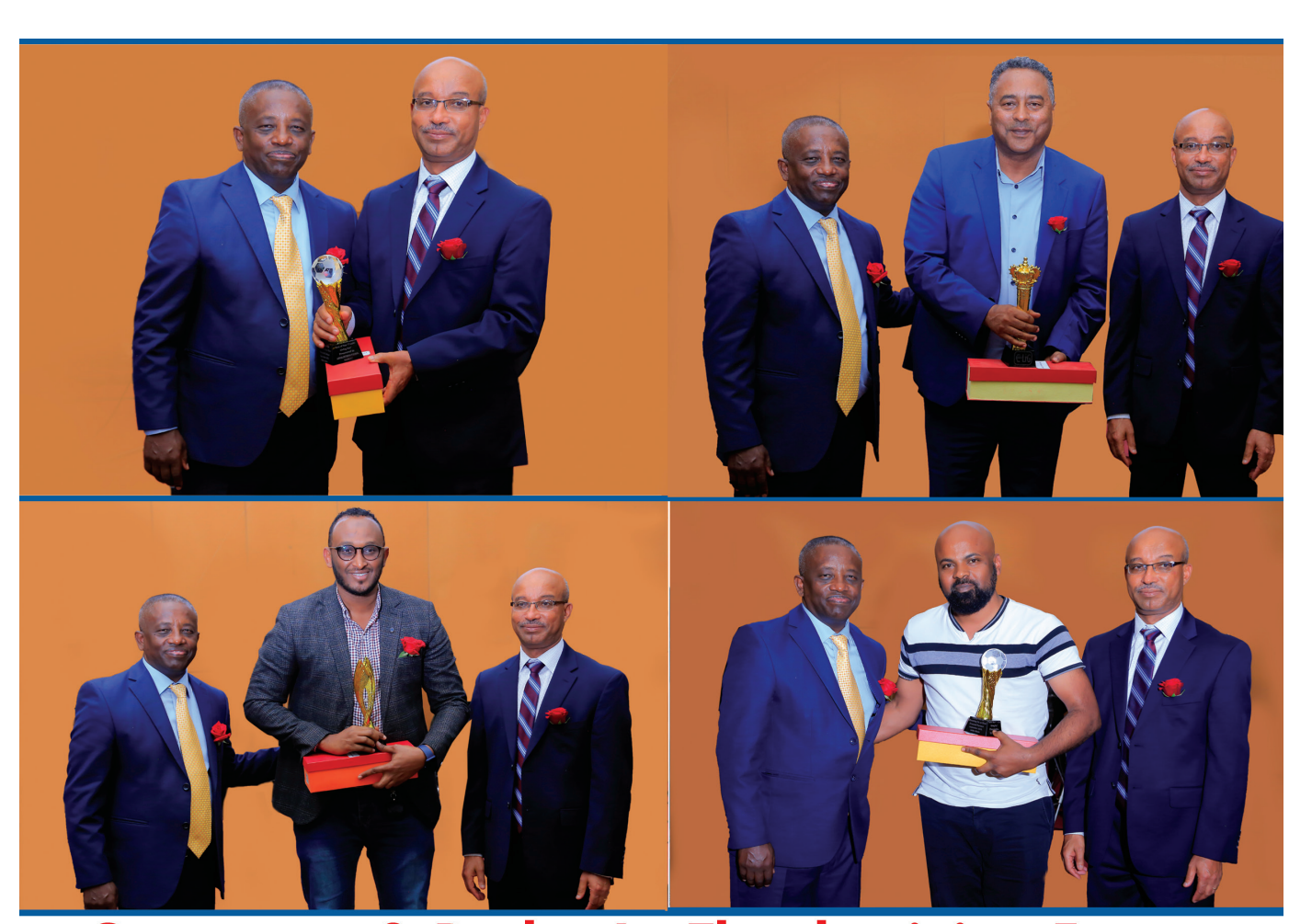
Customers & Broker's Thanksgiving Event 2022/23