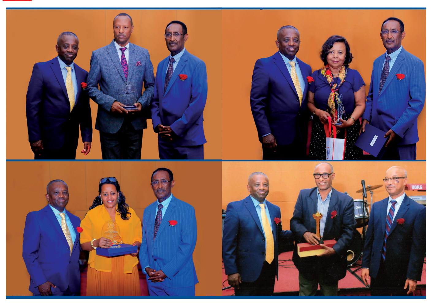
Customers and Brokers Thanksgiving Event 2022/23